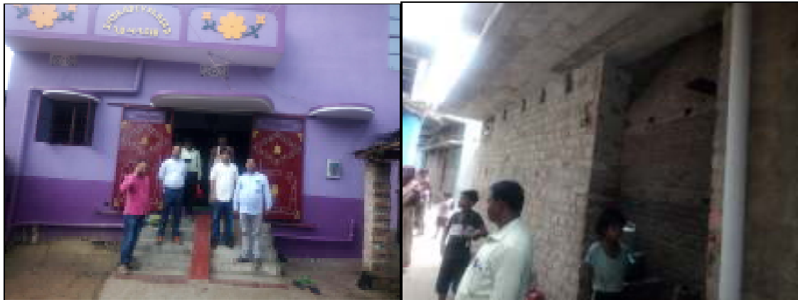
a) Photos of visited training centre are as follows.