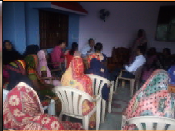
ICDS Centre Constructed under convergence with MGNREGA and NLM Interacting with SHGs