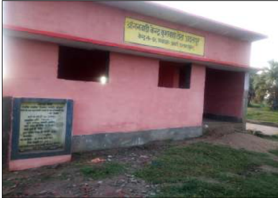
ICDS centre constructed with convergence of MGNREGA.