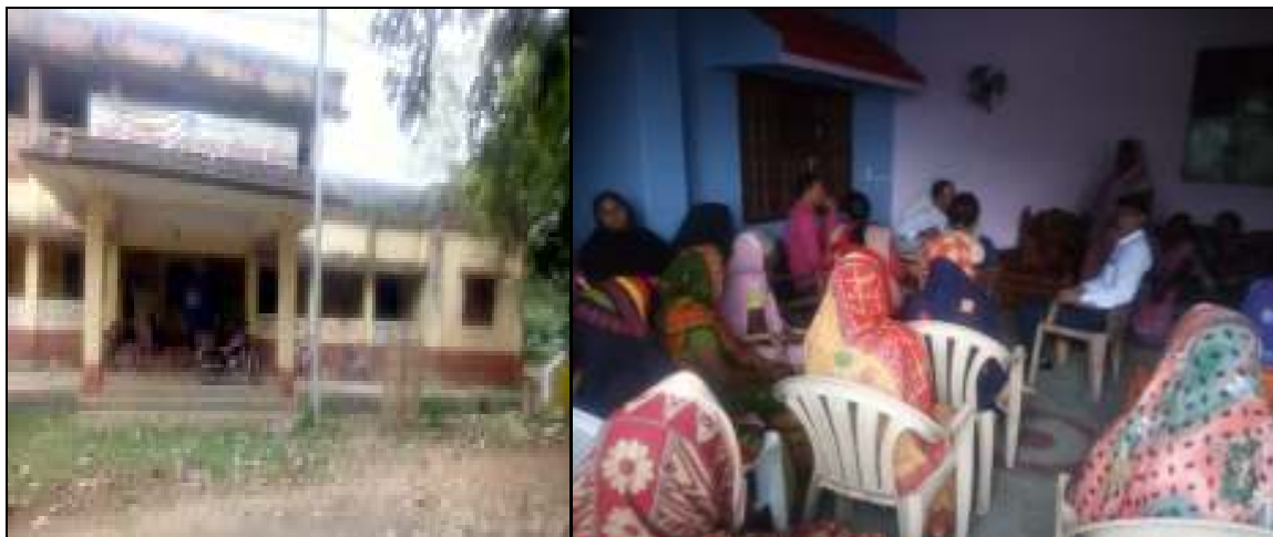
(Institute building and ongoing training Programme)