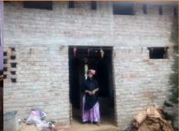
Good Quality of Houses constructed under PMAY-G